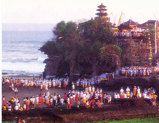
Gods and golf: one of Balinese Hinduism's most important temples is within a few hundred metres of the new Bali Nirwana Resort (below).