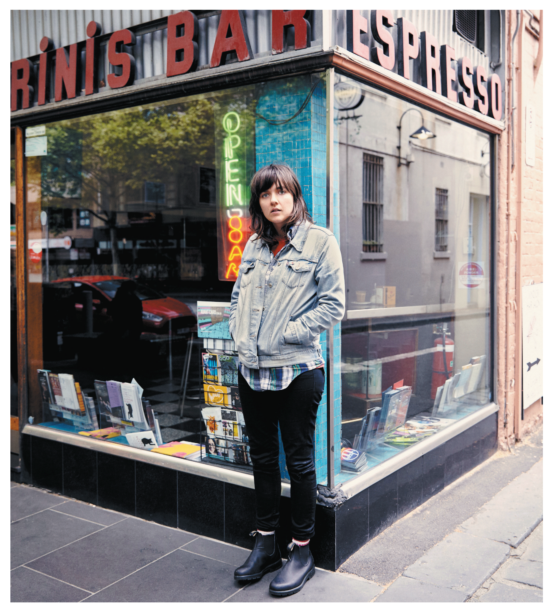
"A LOT OF MY SONGS ARE LOOKING AT SMALL MOMENTS ... ALL THOSE BASIC ELEMENTS OF TREATING OTHER HUMANS IN POSITIVE WAYS . AND ANIMALS AND NATURE ..."